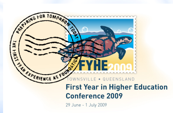
First Year Experience Curriculum Design Symposium 2009